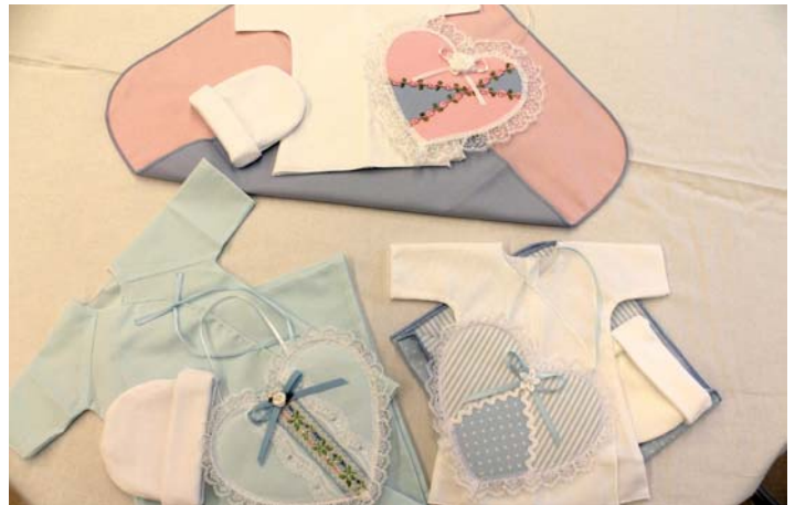
One of many examples of Layette sets that are sent out. Each set contains a gown, cap, blanket and a keepsake heart