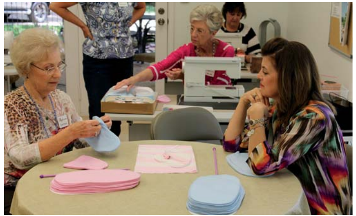
Making the Caps